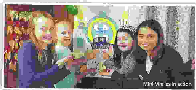
Mini Vinnies in action

Members look for opportunities to help those in need and, when asked, visit individuals and families where they are living and assess their needs. The main purpose of our visits is to extend the hand of friendship. More specific practical assistance can be given depending on the nature of the help required and the capacity of the local membership.