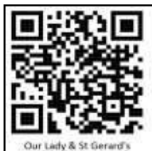
Our Lady & St Gerard's

Donations: Make an online Donation to support our parishes by scanning the QR codes below: