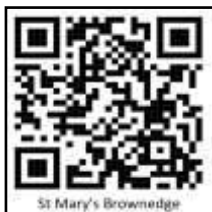
St Mary's Brownedge