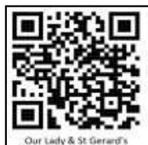
Our Lady & St Gerard's

Donations: Make an online Donation to support our parishes by scanning the QR codes below: