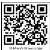
St Mary's Brownedge