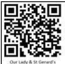
Our Lady & St Gerard's

Donations: Make an online Donation to support our parishes by scanning the QR codes below: