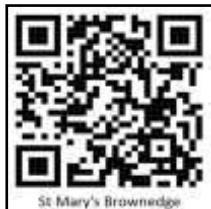
St Mary's Browndale

Universalis.com: Universalis is a website which provides the Mass texts and readings for each day of the year as well as the Liturgy of the Hours. Online it provides free texts for the upcoming 7 days. Buying the App gives full access. This QR Code will take you straight to the Mass Readings of the day: